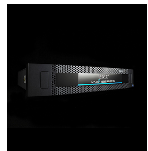
EMC VNXe® storage platform