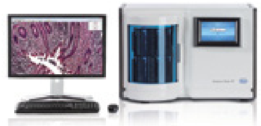
VENTANA iScan HT