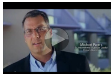
Ventana's Patient Safety Initiative

“As a global leader in helping hospitals, cancer centers, and