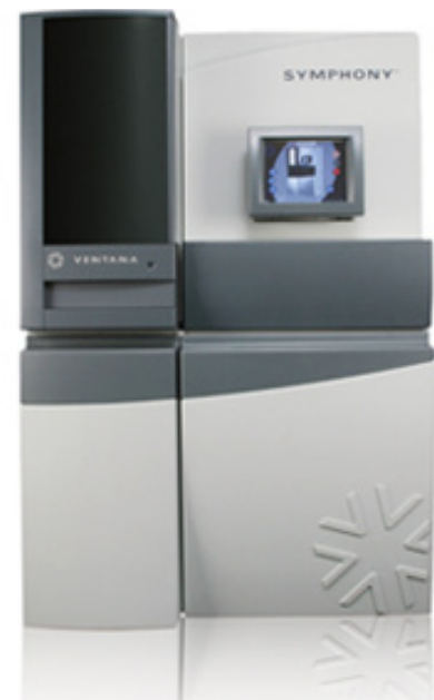
SYMPHONY System – protects against tissue cross contamination during H&E staining